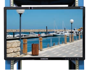
Single 24" Monitor