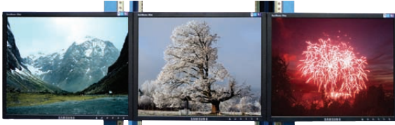
Triple 17" Monitors