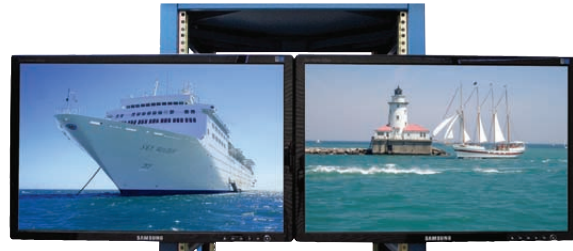
Dual 24" Monitors