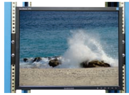
Single 20" Monitor