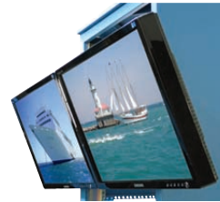
Dual 24" Monitors tilted to provide better viewing.