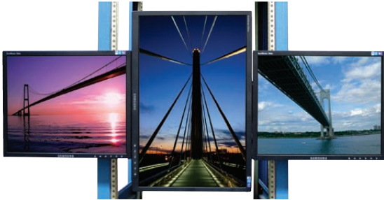
Dual 17" and Single 22" Monitors