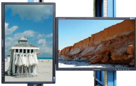
Dual 22" Monitors